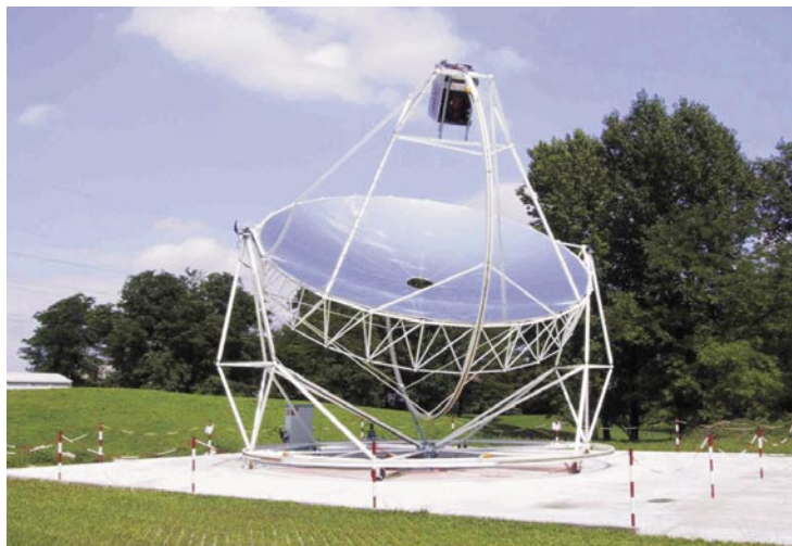
The dish Stirling generator