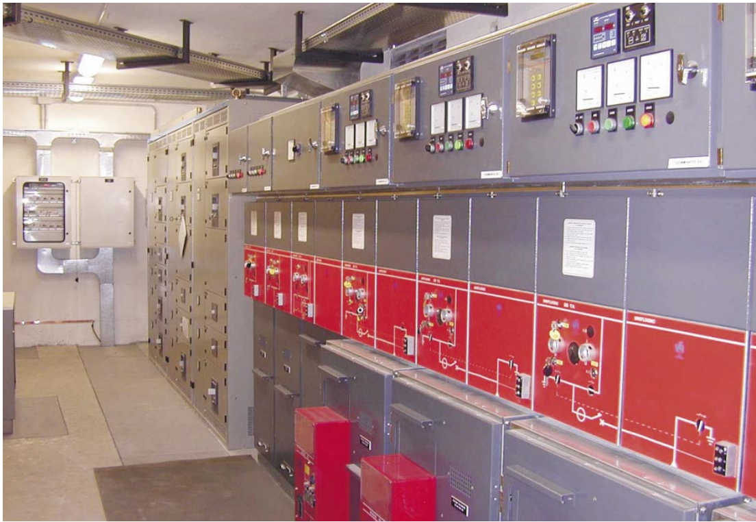
MV and LV supply, switching and interconnection boards for the test facility